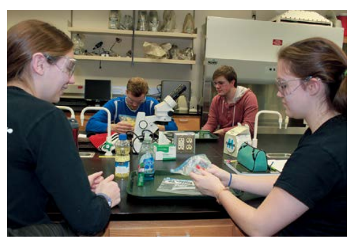
Students in teaching laboratory class

In 1998 I joined the department faculty as the director of biology teacher education. My previous experience as a liaison between St. Louis-area K-12 teachers and Washington