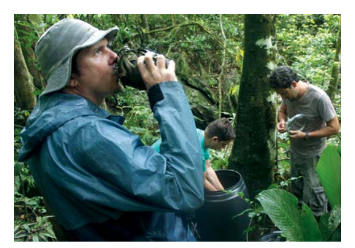
Collaborators in Brazil set up a mosquito experiment.

To an ecologist, any organism can embody multiple fascinating aspects of natural history, a legion of unanswered questions about its adaptations to its environments, the ebb and flow